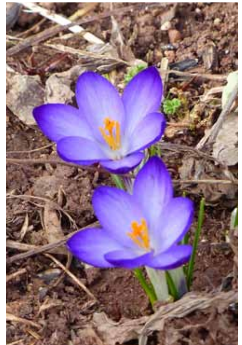
Crocus spring up in Red Rocks Park.