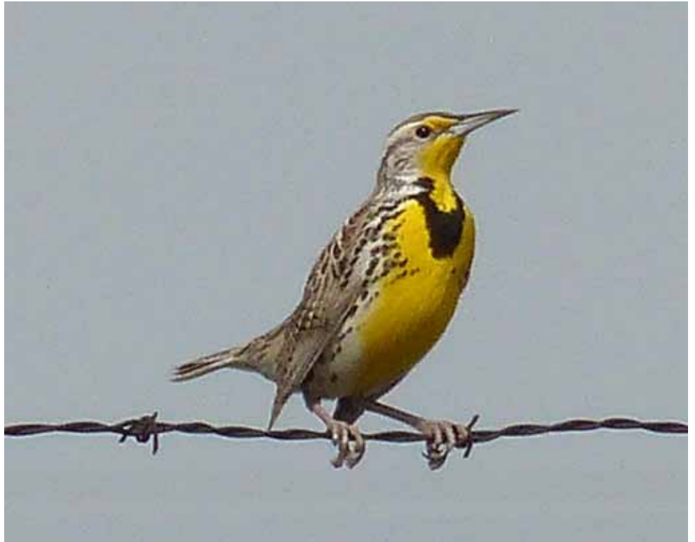
Western Meadowlark.

“The shrike came back down from the aspen to claim his meal. It happened so fast I couldn’t get set up with my camera.