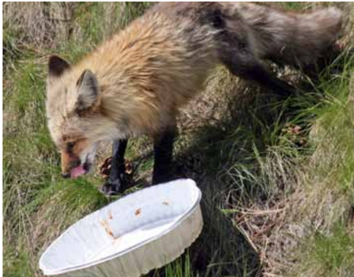
Feeding wild mammals, such as this red fox, is a bad idea.

Since possession is nine-tenths of the law, I think the hawk won the day. It will be interesting to see who prevails over time.