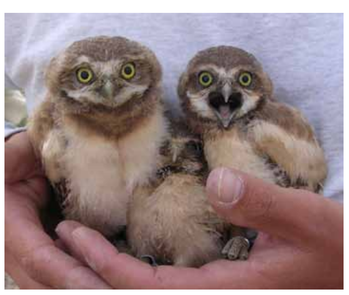
These Burrowing Owls are quite a handful.

April 7, at 7 p.m. at Church of the Hills, 28628 Buffalo Park Road in the downstairs Fellowship Hall.