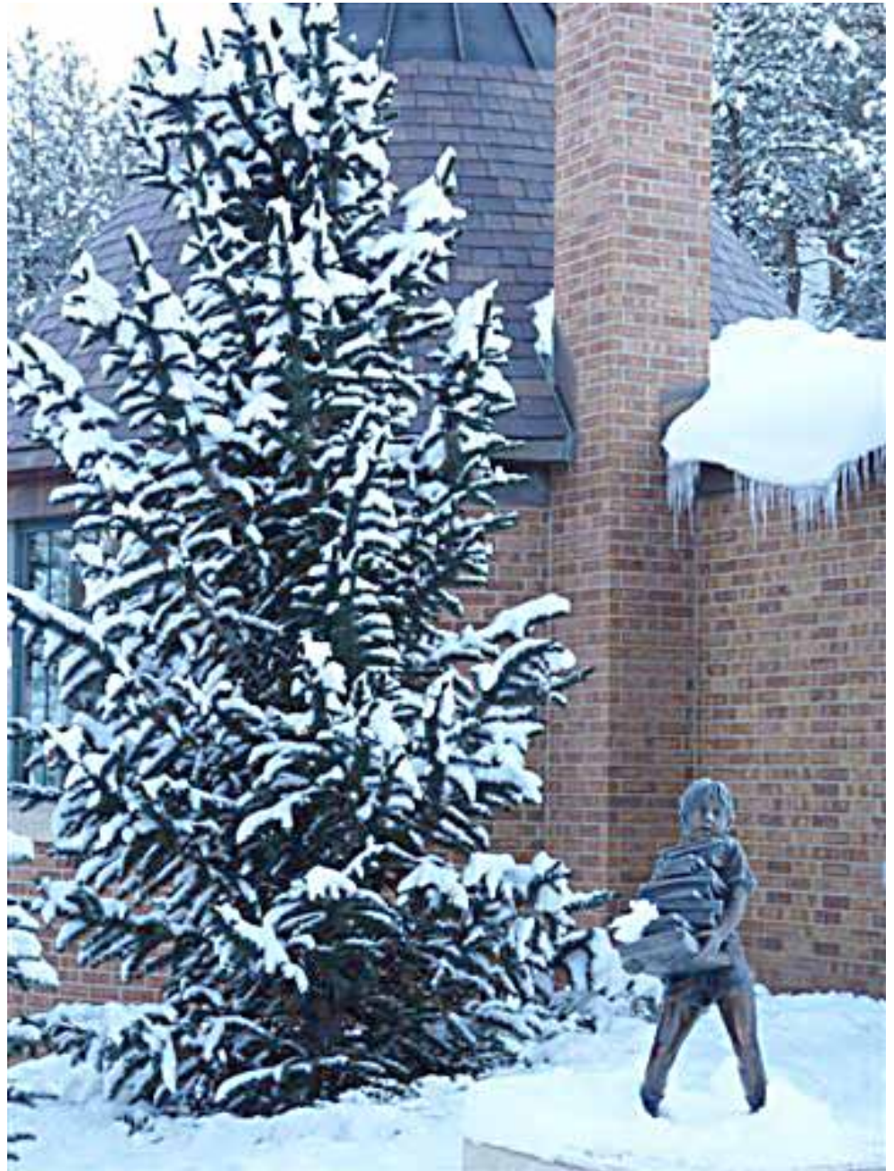
A 20-foot Bristlecone Pine at Evergreen Library lives on as a reminder of the Evergreen Audubon tradition known as the Christmas Tree for the Birds during most of its 30-year history ending in 1998. EA donated the tree, then 10 feet tall, to the new library.