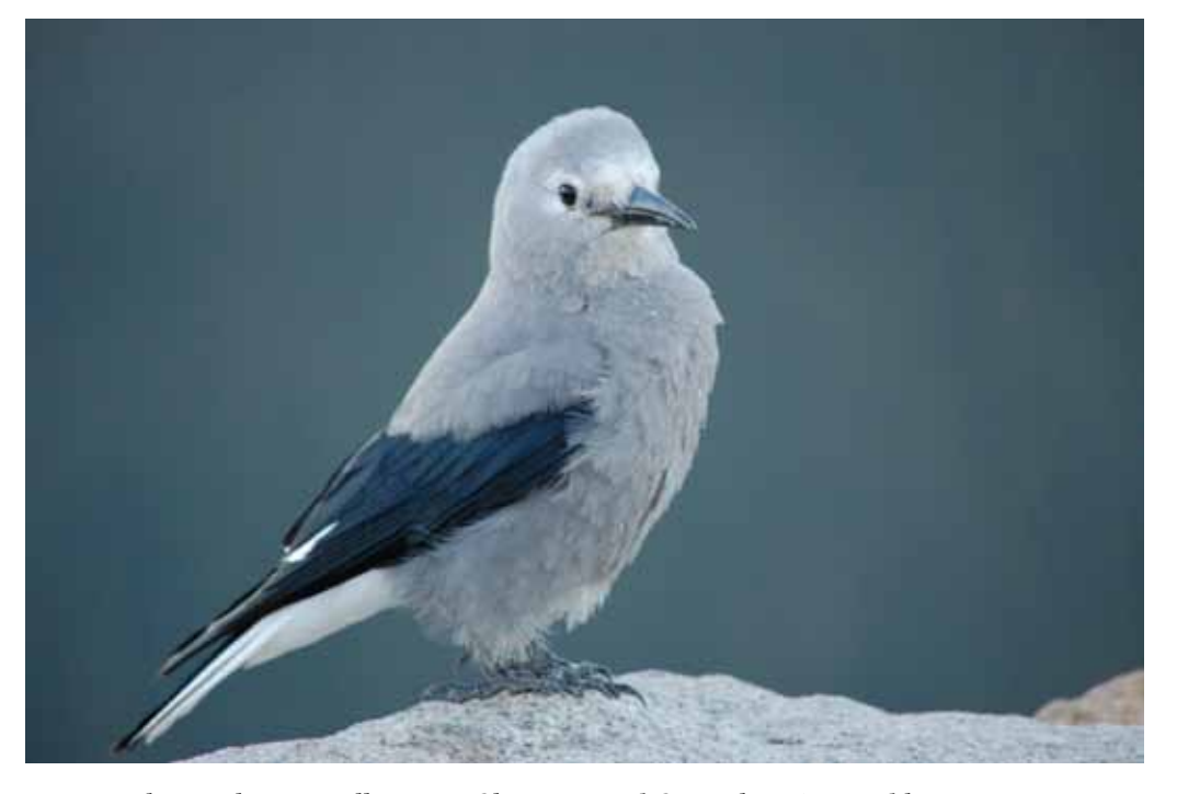
You never know what you will see on a Christmas Bird Count, but it's a good bet some counters will spot a Clark's Nutcracker, above. For a report on a recent sighting, see Bird Business on Page 6.

The Wald home is at 33179 Inverness Drive in Evergreen (303-674-0417). Inverness Drive is off of Hiwan Drive and Lewis Ridge Road. Please sign up at the Dec. 6 EA chapter meeting to bring a Continued on page 4