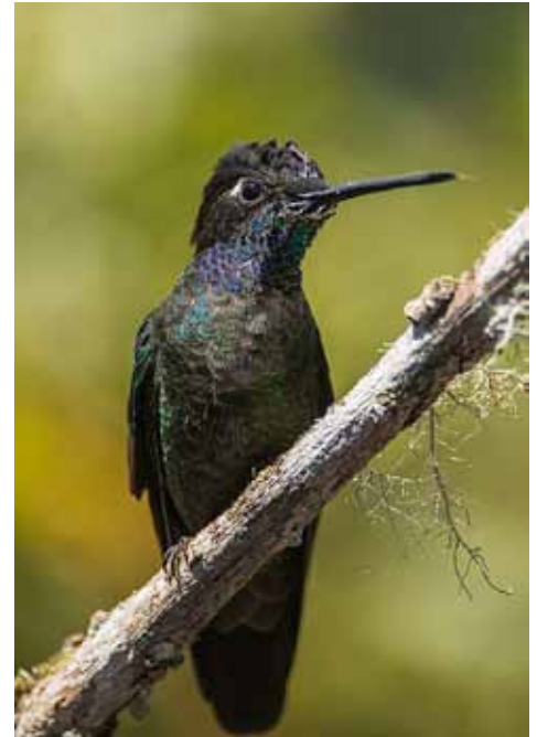
Magnificent Hummingbird.