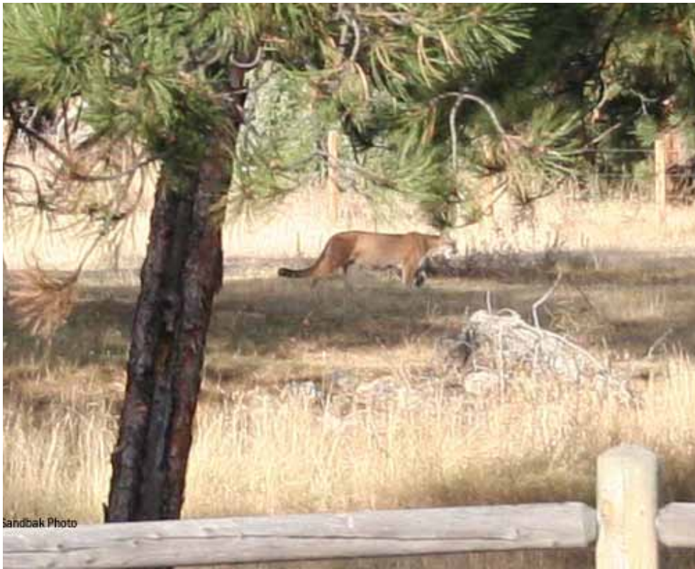
A mountain lion prowls west of Alderfer/Three Sisters park.

On Nov. 8, peakviper posted on EvergreenBirders: “We have seen a female ( Hooded Merganser ) several times over the past month. Today we saw a pair