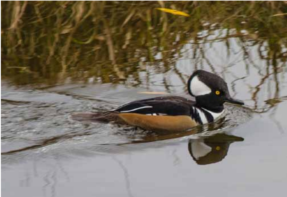
A Hooded Merganser paddles on Upper Bear Creek alongside Evergreen Lake.