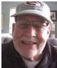
David Walker Raven Award For keeping ENC always up to date on local wildlife news