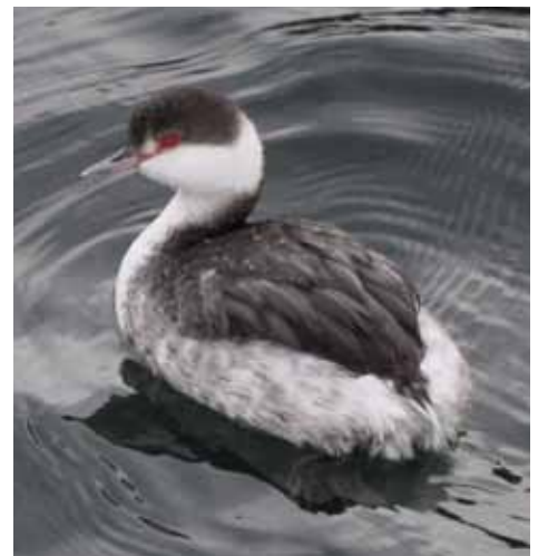
Horned Grebe in basic plumage.

Creek Park on Friday, and had five flocks on Saturday for a rough count of about 350 birds over the two days.