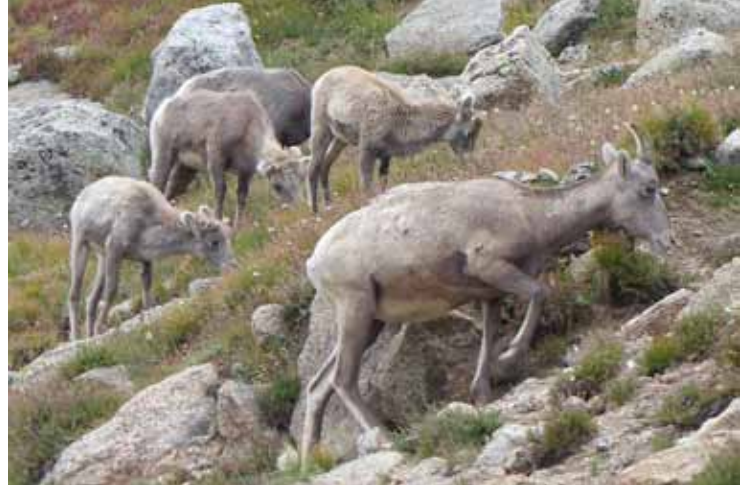
Ewe and lambs on Mt. Evans Sept. 3.

and an uphill escape route. They tend to avoid wooded areas where their vision is limited.