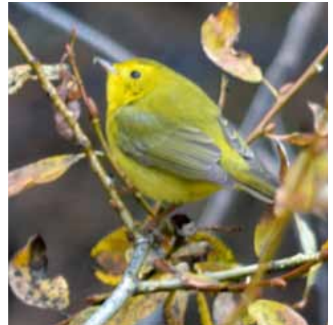
Wilson's Warbler male in basic plumage. Definitely.

It goes without saying that this was a spectacular weekend for catching migrating Sandhill Cranes . I saw two flocks at my house southwest of Cub