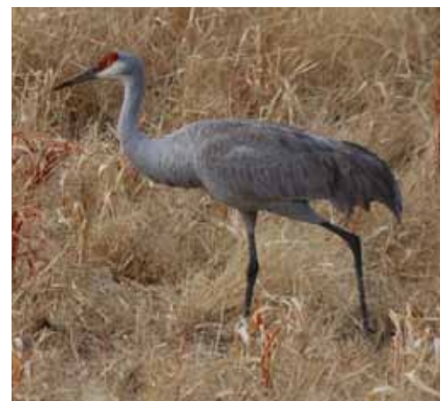
Sandhill Crane foraging.