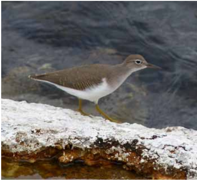
Spotted Sandpiper in basic plumage.