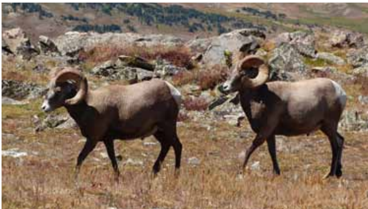
Bighorn Sheep rams taken in Rocky Mountain National Park Sept. 8.

Look for bighorn sheep in rocky terrain with good visibility