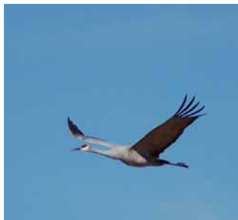
Sandhill Crane in flight.