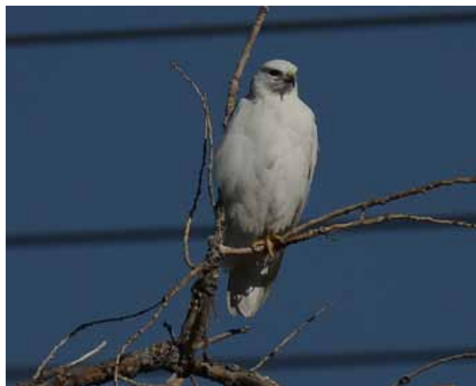
The famous Westminster leucistic Red-tailed Hawk.