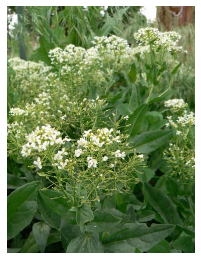
Hoary Cress.

It is a perennial and has an extensive, 10- to 15-foot-deep root system, making it difficult to eradicate. This plant pro-