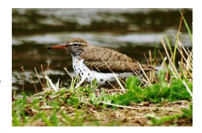
Spotted Sandpipers have been seen at Evergreen Lake this spring.