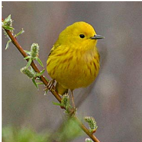
Yellow Warbler at Corwina Park.

The March 6 meeting will take place at 7 p.m. at Church of the Hills (28628 Buffalo Park Road, across from Evergreen Library, downstairs in the Fellowship Hall). Refreshments and a business meeting will follow the program.