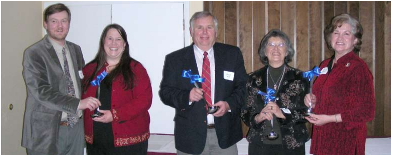
The Royal Order of the Dipper was presented to these worthy recipients at the Annual Banquet. Left to right: