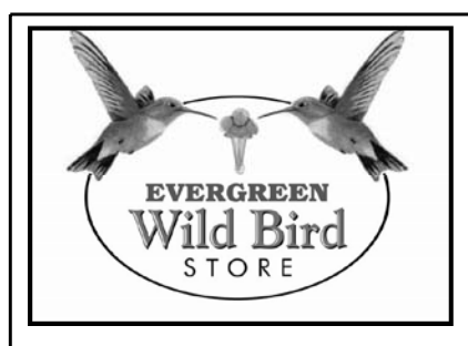
Local & Independent