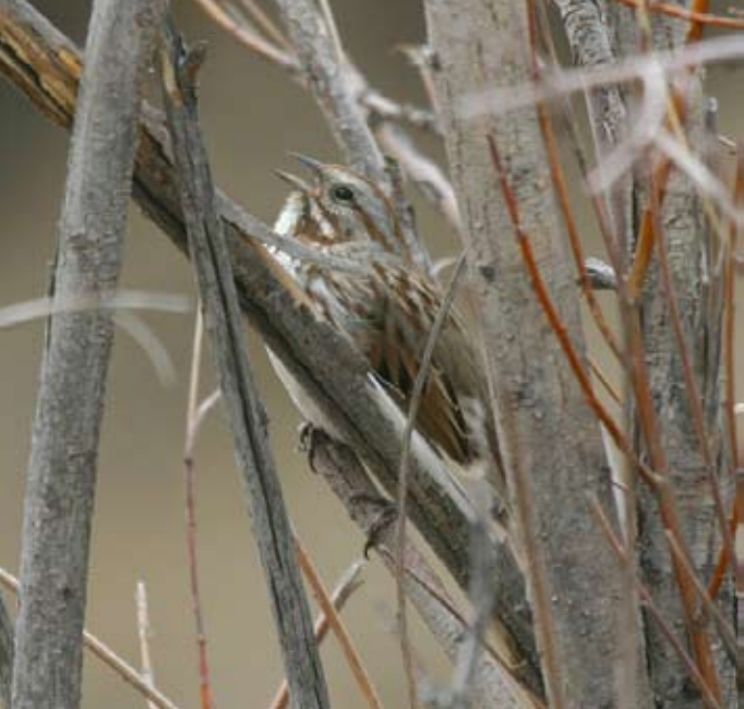
Song Sparrow.

coloradocountybirding.org). He is an expert on bird songs and calls and generously gives presentations and field trips to help teach others.