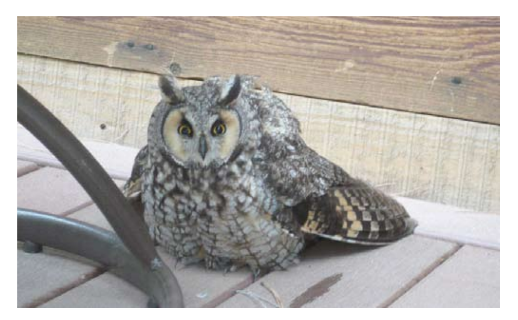
Long-eared Owl recovering from a window collision.

Please keep the work fairly small, nothing more than 30 inches by 30 inch-