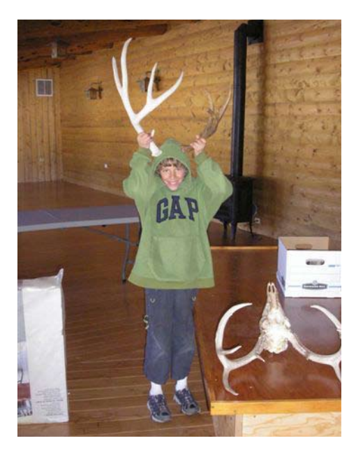
A young volunteer checks out items at the new Evergreen Nature Center touch table.

Additionally, volunteers must complete four to six hours of visitor assistant training and attend a volunteer orientation. On-the-job training will be provided.