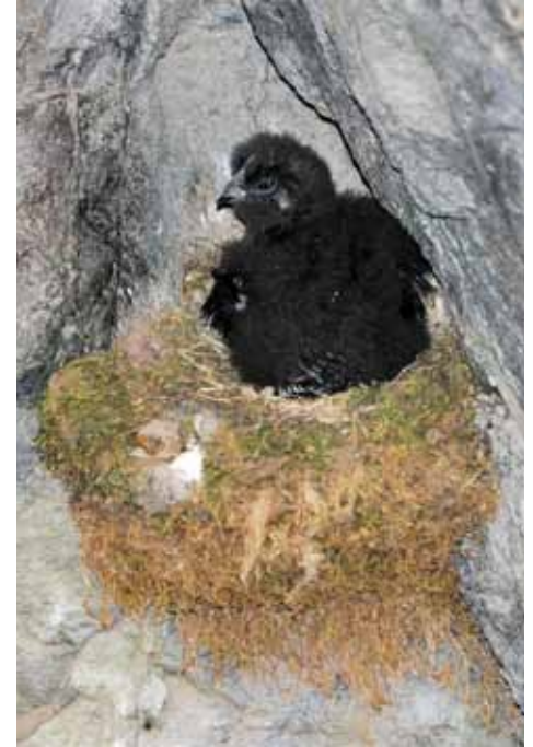
Black Swift chick on the nest in Box Canyon in Ouray, Colo.

Thirteen nests have been identified this year by longtime observer Sue Hirshman and we were able to see four of them. Three had chicks on the nest and one was empty.