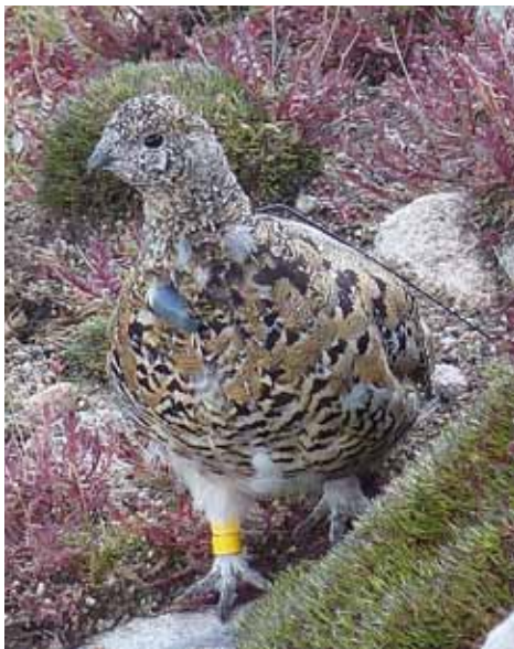
White-tailed Ptarmigan hen banded on Mt. Evans on Aug. 21.

drove the road on Aug. 30. The unstable parts of the road have been reinforced and supported. At the summit, I found a male Wilson's Warbler in the shrubs, still in breeding plumage.