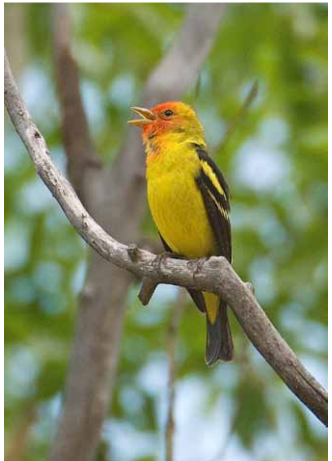
The Western Tanager symbolizes the migration theme of this year's Bird House Bash: Aves sin Fronteras.

Bird House Bash Aves sin Fronteras birds without borders