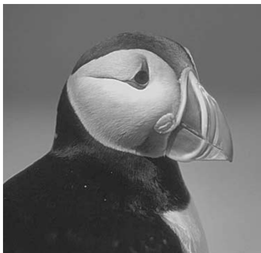
Atlantic Puffin.