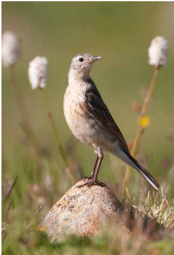
An American Pipit graces the scenery on Mount Evans July 31.