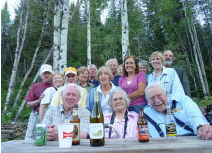
A hot time was had by all on the Copper Bar Ranch in July (see Field Note below).

Please support Evergreen Audubon by participating in this important fundraiser and get ready for the holidays now!