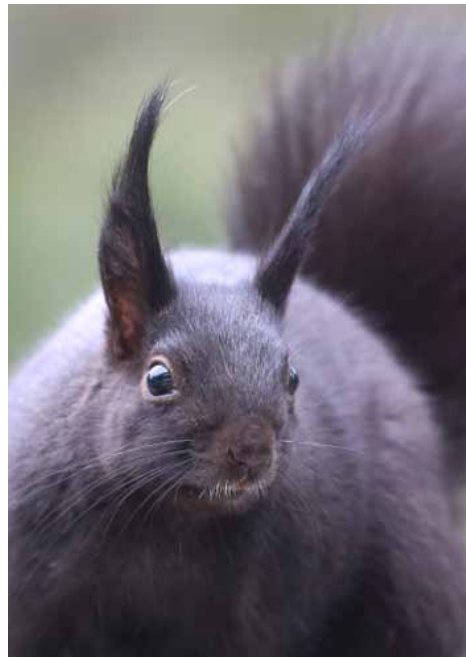
Black-colored Abert's squirrel in Evergreen.

They have conducted training and consulted on rehabilitation topics and wildlife issues. They co-founded Wild-