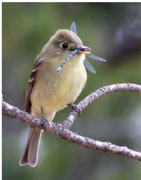
Cordilleran Flycatcher with damselfly.

actively feeding on the horde of Bluet Damselflies present.