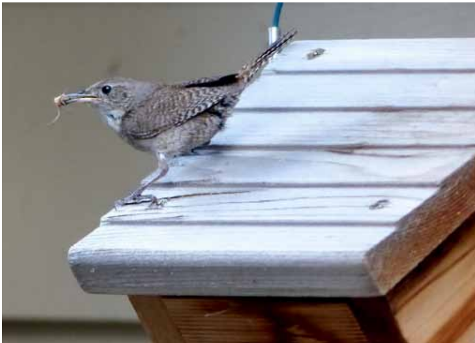
House Wrens cause a lot of chatter in July.