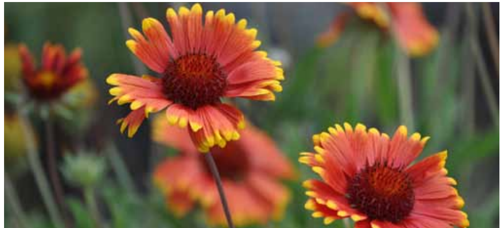
Gaillardia were world class on Bergen Peak Bird Walk.

It goes without saying that the wildflowers were stupendous. The Gaillardia are world-class this year.