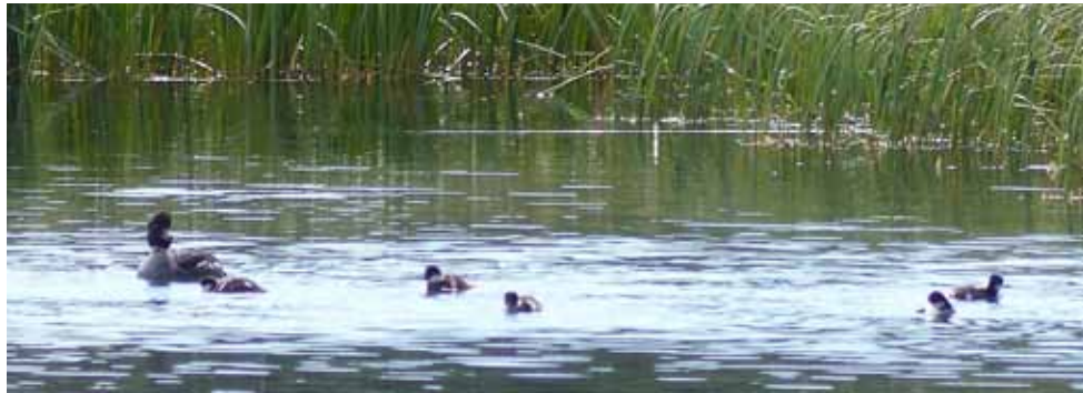
Barrow's Goldeneye family at Echo Lake.

I first observed Cordilleran Flycatchers at Echo Lake this year on July 11,