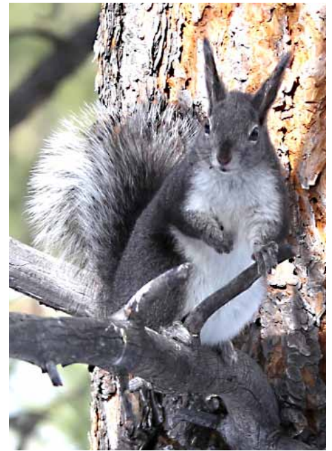
Silver-colored Abert's squirrel.

He also was instrumental in local bond elections supporting local parks