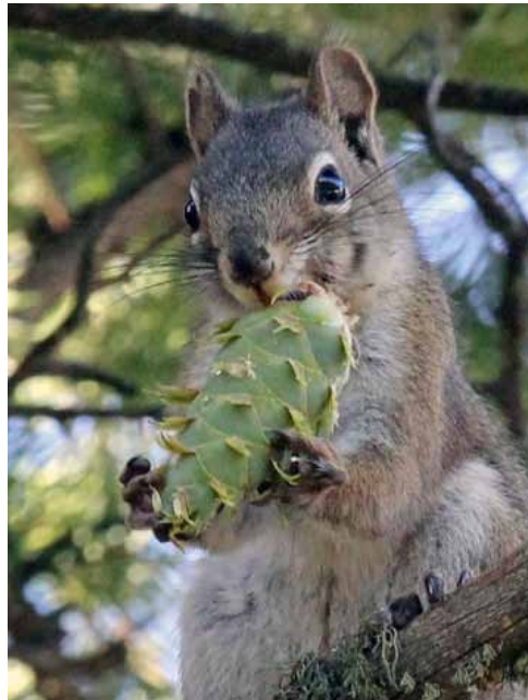
Pine squirrel.

Many Audubon members are avid birders, and many of our programs have focused on birds. Broadening the view of our Evergreen world, our September chapter meeting will focus on two native tree squirrels in the Evergreen area: Abert's and pine.