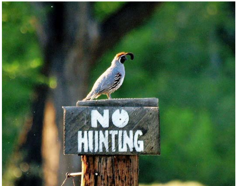
Gambel's Quail at Grand Junction Audubon Center.

Note: Preliminary offer. I have the pieces for a walnut table (two top pieces and numerous legs and supports) that will require woodworking, but well worth the effort. If any Audubon member wants to view them before the garage sale Sept. 26 and make an offer, please call Peggy at 303-674-8648.