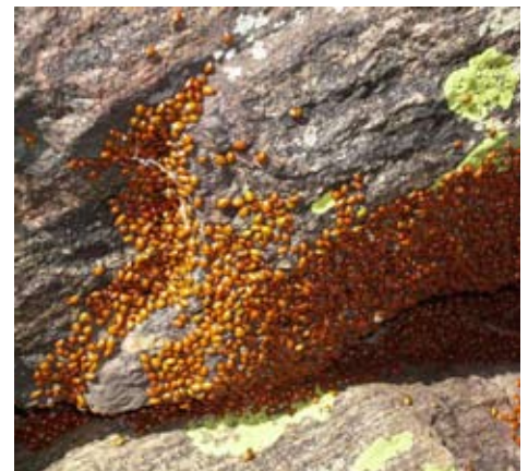
Ladybug aestivation is an unusual occurrence, here seen at Genesee Park.