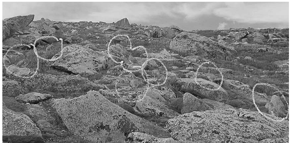
Eight ptarmigan. (Editor's note: There is a certain irony including photographs showing birds who make a career of camouflage.)