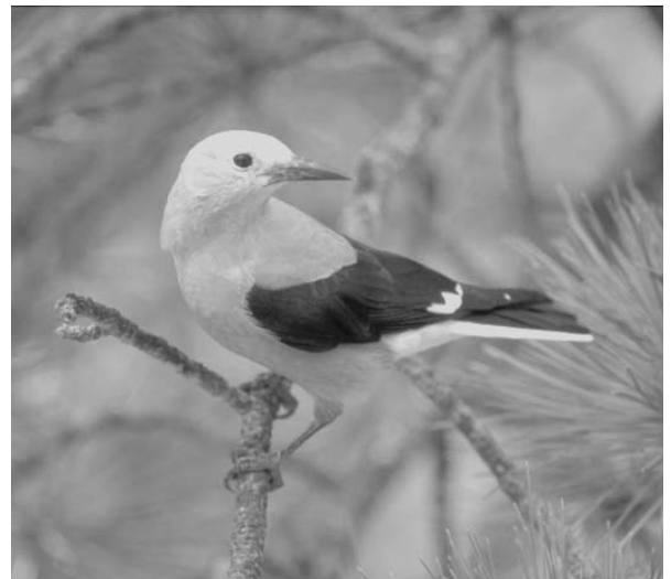
Clark's Nutcracker likely to be seen at the CBC.

Our program will begin with the speaker and the bird slides, followed by refreshments and then a short business meeting with re-