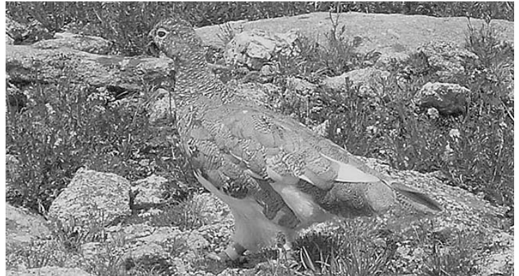
A ptarmigan banded by Clait Braun.