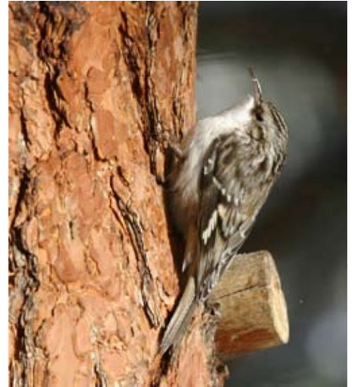
Brown Creeper on Bear Mountain

Don't miss this winter bird refresher on Thursday, Dec. 6, at 7 p.m. at Church of the Hills, 28628 Buffalo Park Road (across from Evergreen Library) in the downstairs Fellowship Hall.