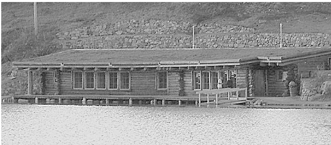
Refurbished Evergreen Lake Warming Hut.