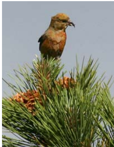
Red Crossbill in Corwina Park