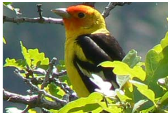
The Western Tanager nests in Colorado and migrates to Central and South America. Photographed in Mt. Falcon Park.

The House Natural Resources Committee, Subcommittee on Fisheries, Wildlife and Oceans, held an oversight hearing July 10, titled "Going, Going, Gone? An