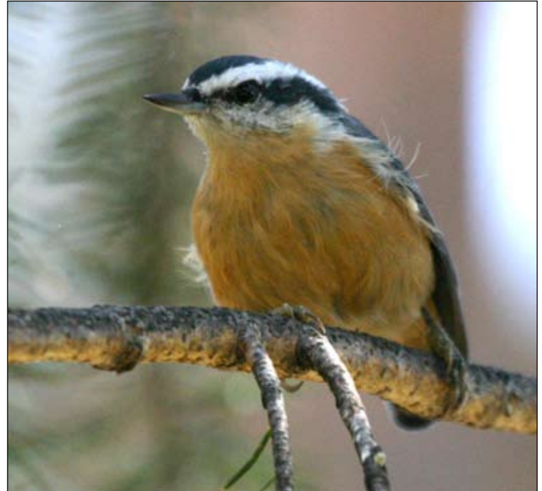
Red-breasted Nuthatch, a winter resident.

We hope this program will be a good review for the Christmas Bird Count and for increasing your enjoyment of our winter birds. Our program will begin with the Christmas Bird Count overview and slide show, fol-