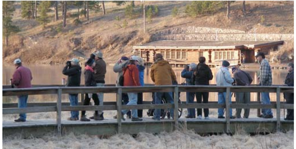
Early birders on the Evergreen Lake boardwalk search for birds at the Dawn Chorus.

Temps were in the low 30s to start and ended at 56 degrees at 9:15. 2008 was a record for our counts, both for humans and avian species. Never before have our numbers been so high for either!