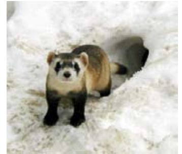
A male Black-footed Ferret.

With his direction the FCC also promotes the Black-footed Ferret recovery through education and public outreach programs that emphasize the prairie dog ecosystem that it and numerous other species rely upon.