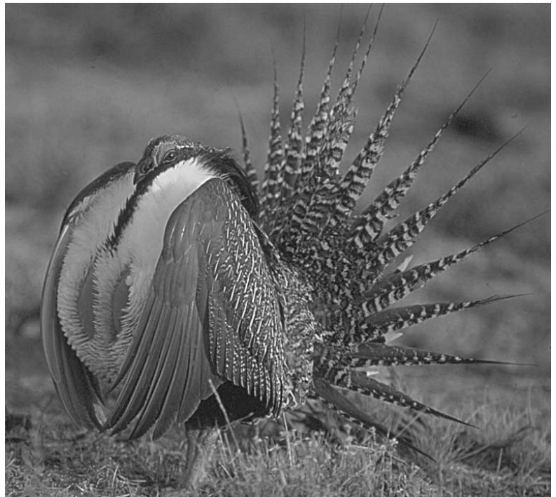
Gunnison Sage Grouse.