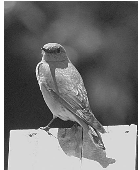
Mountain Bluebird on Top of Nest-box.